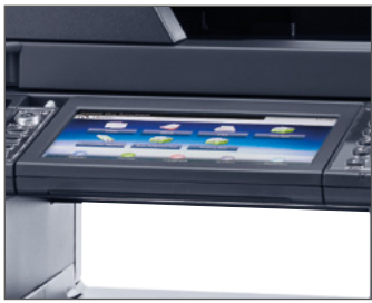
7" touchscreen display, tilt in 3 steps (0, 10, 20 degree)