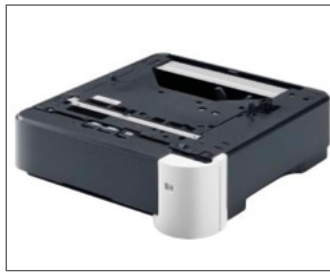
Large paper capacity up to 2,600 cut sheets